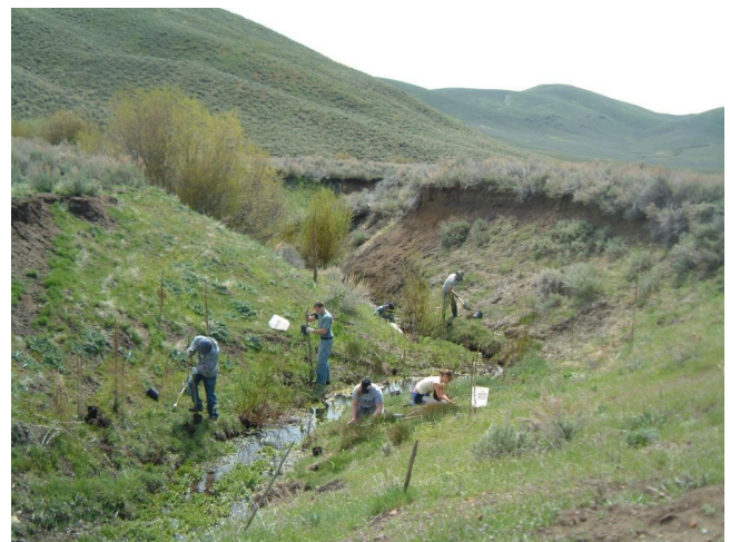
Lava Lake staff working with volunteers and agency personnel on a stream restoration project.

https://secure1.fiberpipe.net/lavalakelamb/lava-lake-conservation.php