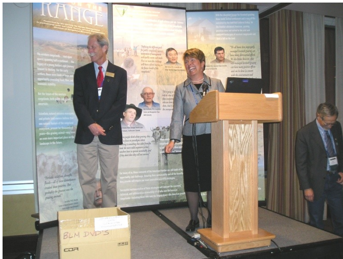
SRM Presidents and BLM-SRM Liaison enjoy activities during BLM Family Meeting in Albuquerque.

We enjoyed an impressive roster of speakers who covered topics relating to BLM operations as well as the